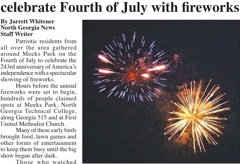
Fireworks over Meeks Park for Independence Day 2019.