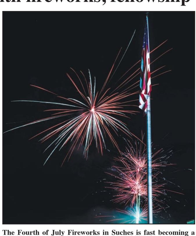
crowd favorite in the North Georgia Mountains.

Meanwhile, on the other end of the field, the fireworks were carefully arrayed on and around the cement basketball courts while the MVP's of as they geared up for another